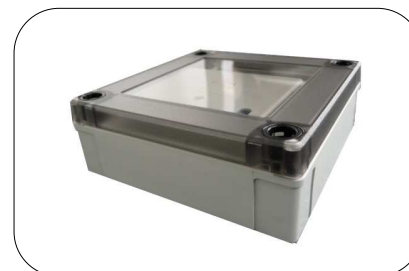
Case for outside mounting

• Solva Paasheuvelweg 26 1105 BJ Amsterdam-ZO The Netherlands