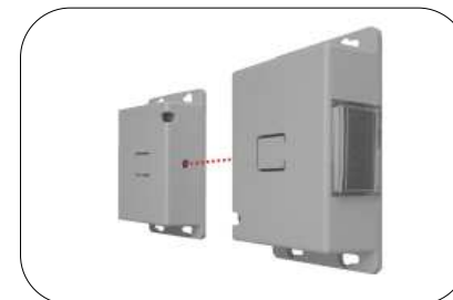
Side Firing sensorset